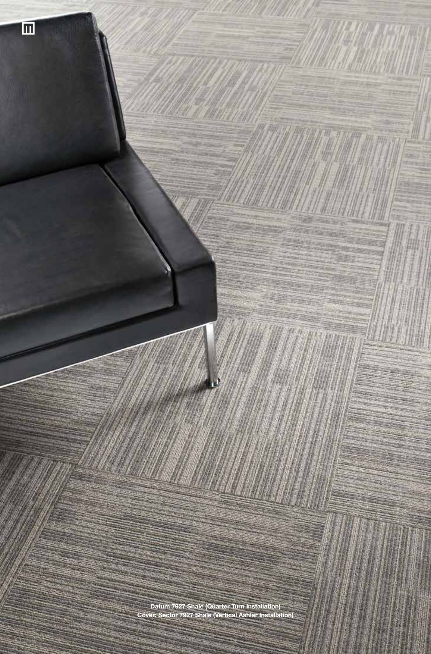
Datum 7927 Shale (Quarter Turn Installation) Cover: Sector 7927 Shale (Vertical Ashlar Installation)